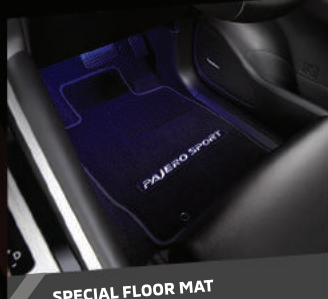
SPECIAL FLOOR MAT