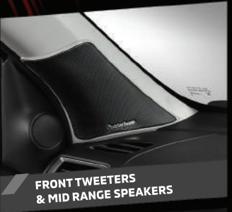
FRONT TWEETERS & MID RANGE SPEAKERS