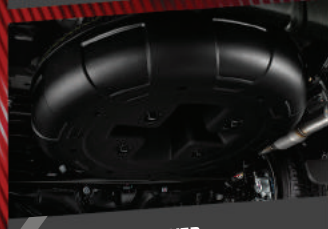
SPARE TIRE COVER