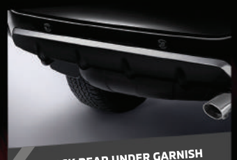
BLACK REAR UNDER GARNISH