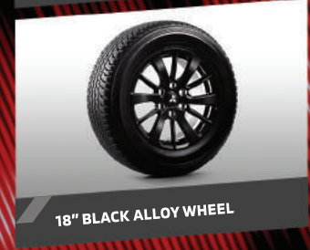
18" BLACK ALLOY WHEEL