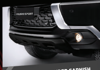
BLACK FRONT UNDER GARNISH