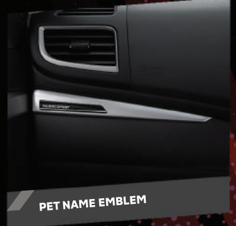
PET NAME EMBLEM