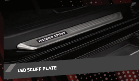
LED SCUFF PLATE