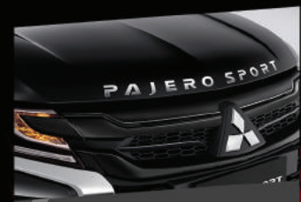
BOLD BLACK PAINT GRILLE